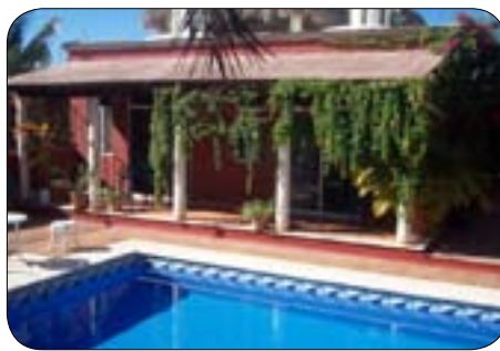
2 Bedroom, 2 Bathroom Home in Great Location ▪ Swimming Pool & Rooftop Palapa ▪ US$ 185,000