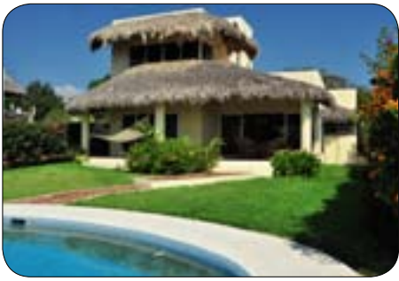
2 Bedroom Home with Sunrise to Sunset Views over Playa Zicatela & the Pacific Ocean ▪ US$ 275,000