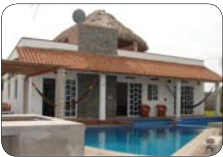
Surfers Paradise ▪ 2 Bedroom Oceanfront Home with Pool on Playa Zicatela ▪ US$ 425,000