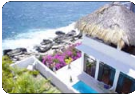
Best Location in Town! 3 Bedrooms, 3 Baths w/ 2 Roof Decks, Palapa & Barbecue Grill ▪ US$495,000