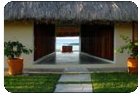
3 Bedroom Beach House at Costa Cumana ▪ Award Winning Luxury Loft Design ▪ US$ 769,000