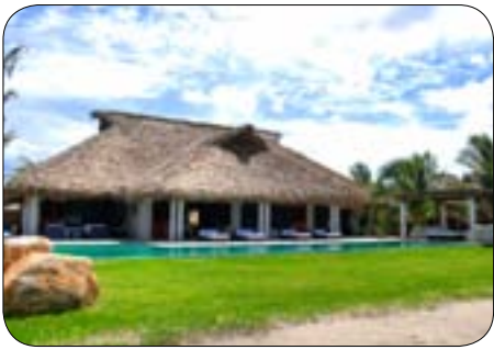
2 Oceanfront Master Bedrooms, 4 Guest Bungalows, Office and Staff Quarters ▪ US$ 1,895,000