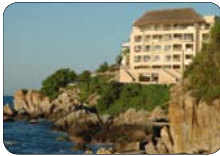
2 Bedroom Oceanfront Condo with Sweeping Sunrise Views Over the Bay & Playa Zicatela ▪ US$ 299,000